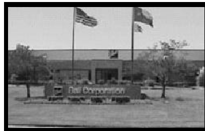
Ball Corporation Fort Worth

Please join us for this unique opportunity to visit one of our local manufacturing enterprises. The tour is open to all MANT members and visitors. However, all participants must be registered in advance of the event. Tour fees are $15 for members and $20 for non-members. The event will begin at 3:00 pm and adjourn by 4:30 pm. Light refreshments will be served. Please see our fax-back form on page 4 to reserve your place. Space is limited to the first 40. See you there!